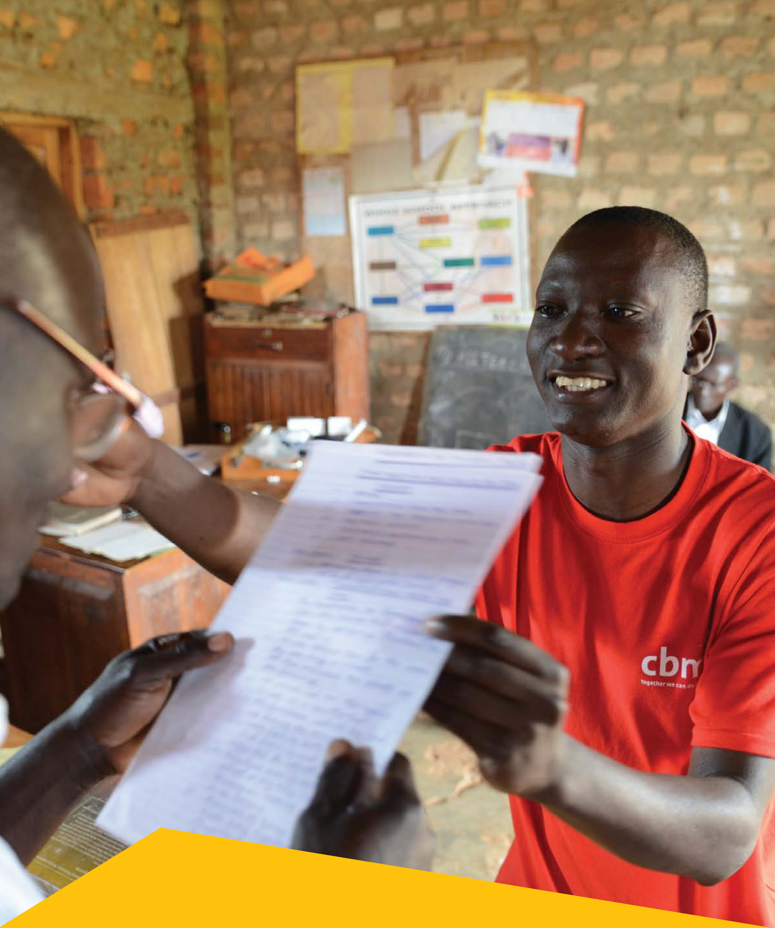
Man in a CBM teeshirt hands over a piece of paper to another man.