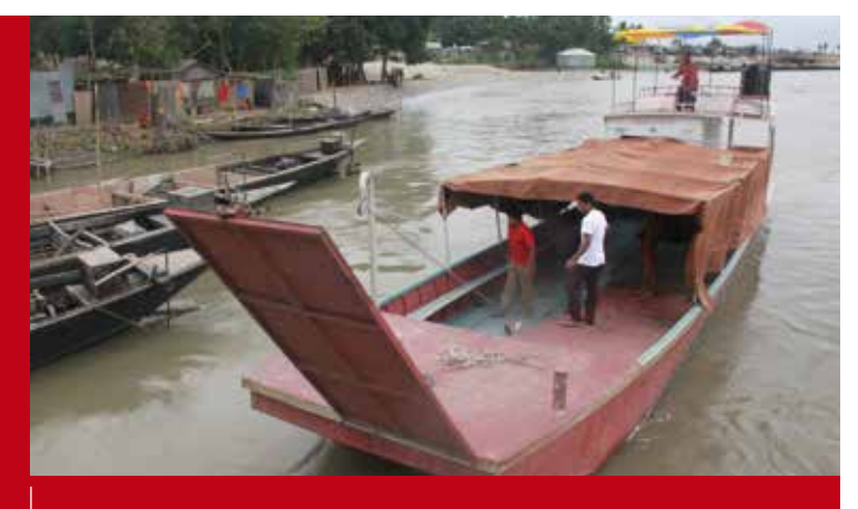
Accessible evacuation boat

To ensure sustainability, families were encouraged to make the person with disability owner of the land or at least part of the house and only then where the house constructed or renovated. This was done because typically persons with disabilities are discriminated against, and sometimes overlooked by their families in ownership of land or rooms in a house. The cost of one flood risk universally accessible house along with installation of one accessible tube well and latrine was approximately US$ 1,212.