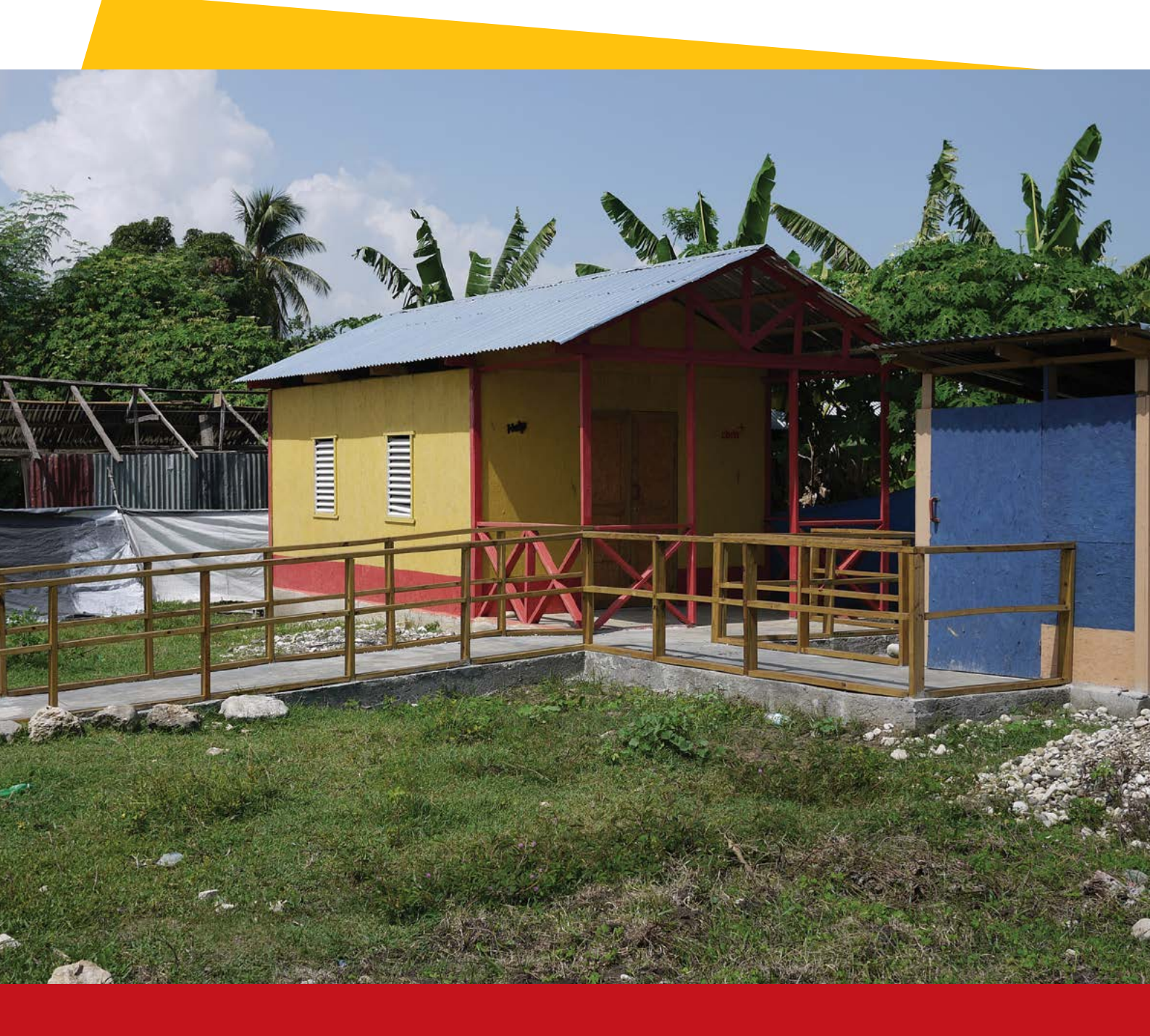
Haiti after the earthquake from January 2010: Accessible shelter.

Work with local communities, municipalities, urban planners, construction professionals, designers, universities and private sector to adapt and/or develop accessible transportation, communications and infrastructure, including recreational spaces in line with CRPD.