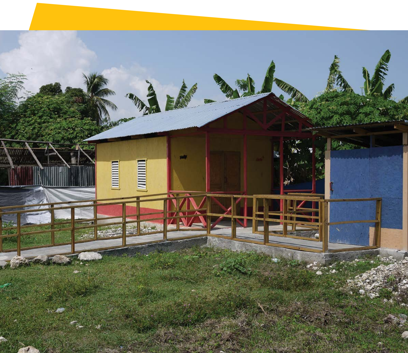
Haiti after the earthquake from January 2010: Accessible shelter.