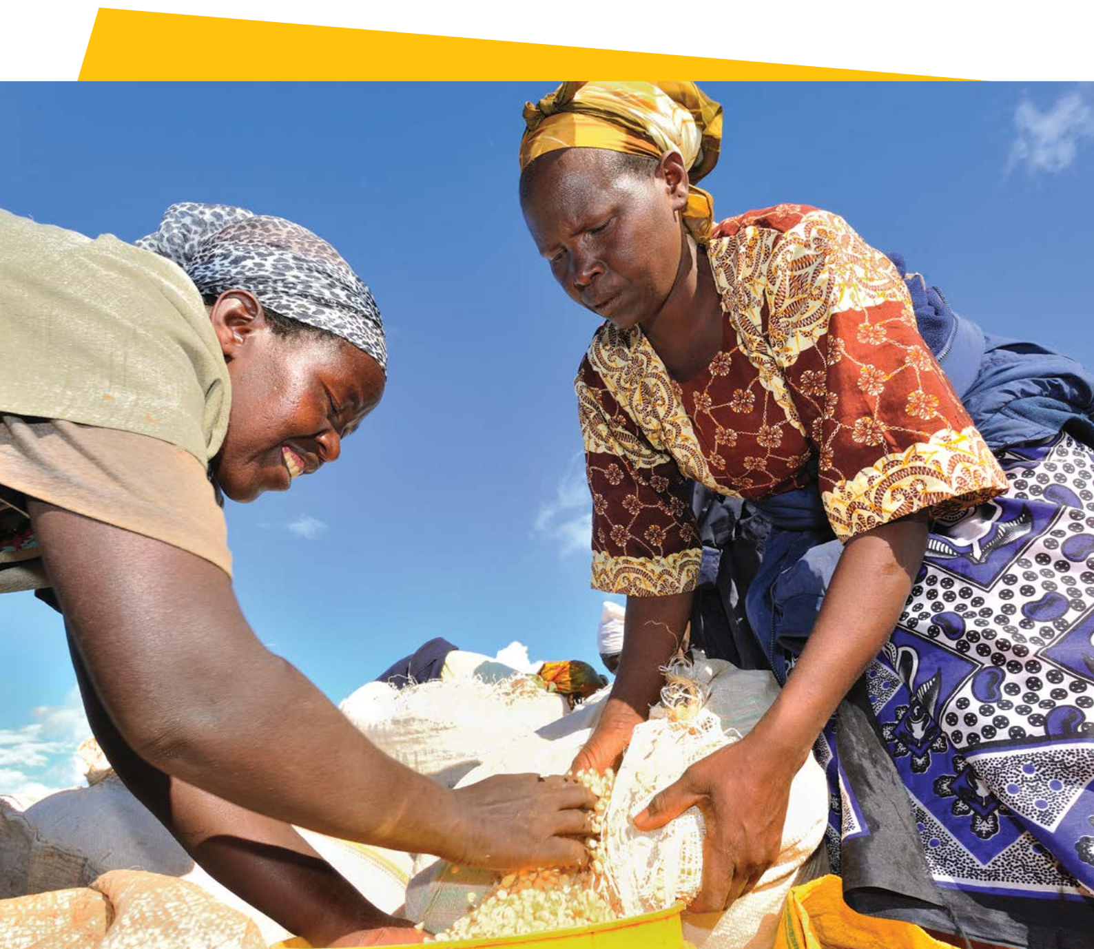
Food distribution in Kenya.