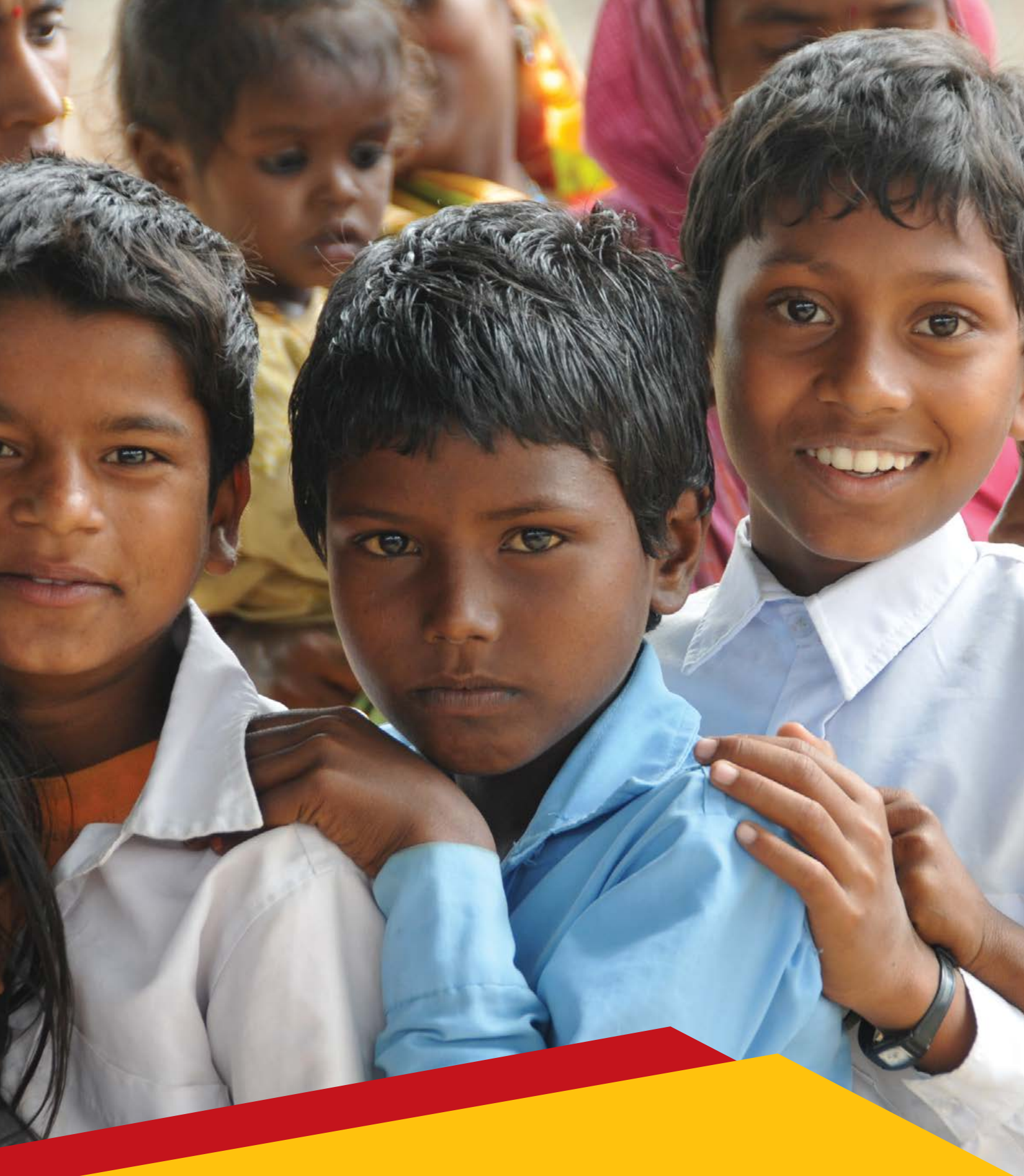
Pupils attending a free pediatric eye and ear camp held on school premises - Nepal.